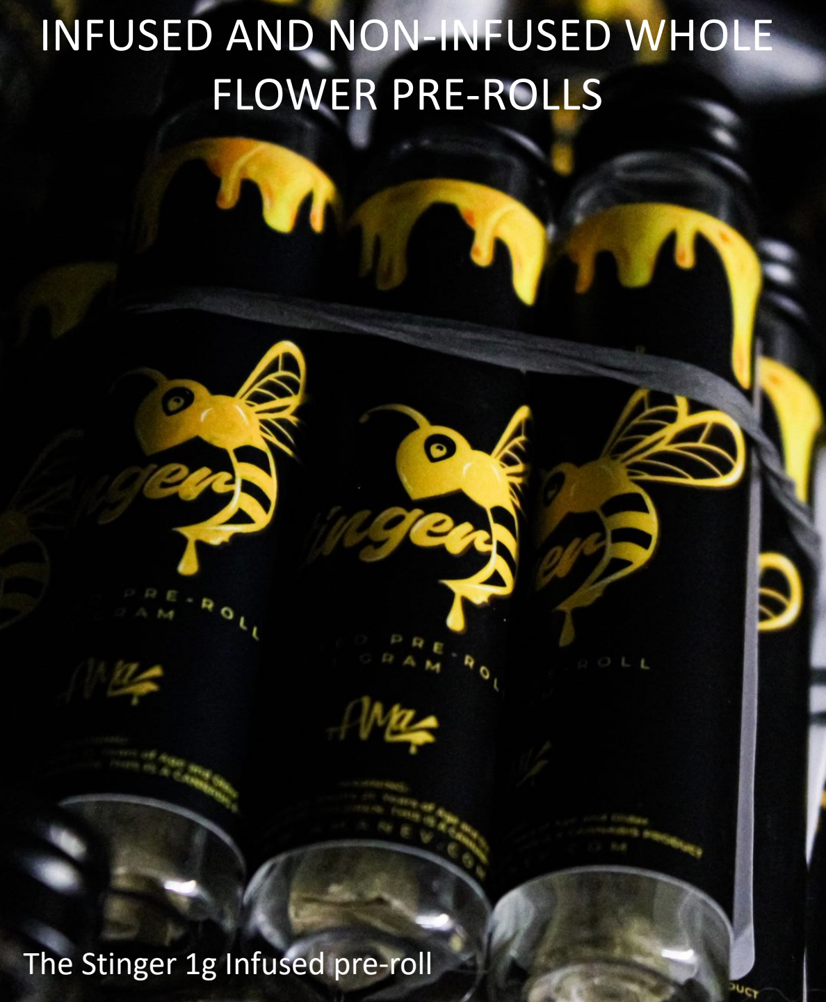
The Stinger 1g Infused pre-roll